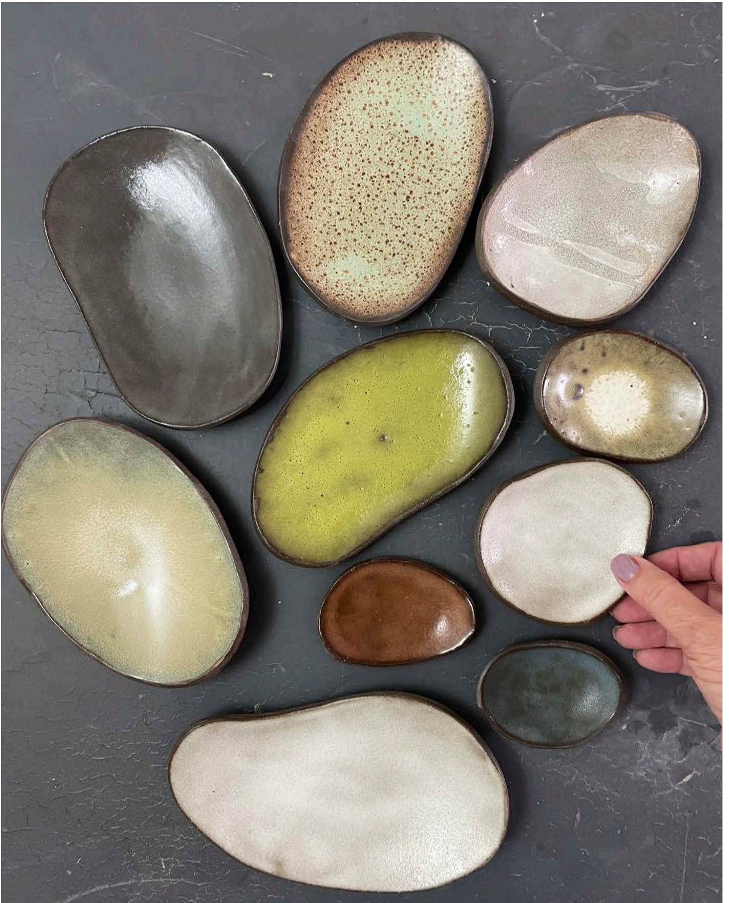
Clockwise from center top - Pistachio, Paper Mache, Moonshadow, Linen, Ink, Linen, Moonshadow, Steel - In Center - Avacado & Leather