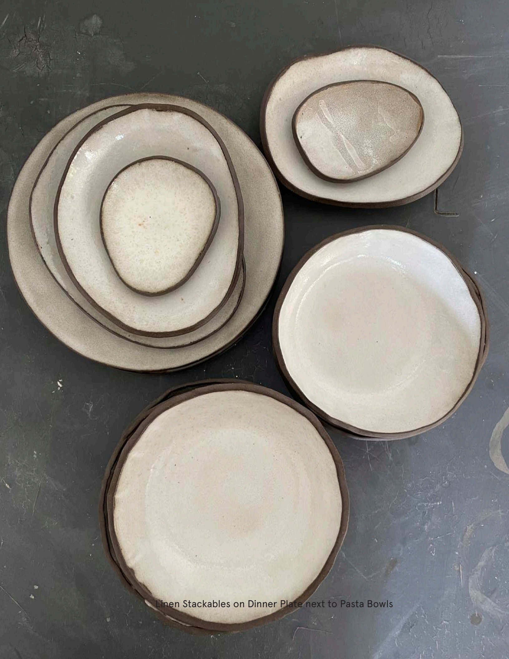
Linen Stackables on Dinner Plate next to Pasta Bowls