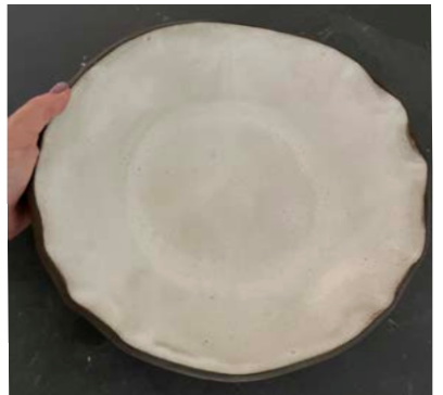
Top L to R - Edge Details, Set of Stackables, Side View of 3 Pasta Bowls, Center L to R - Dinner Plates, Breakfast/Dessert Plates, Top View of Pasta Bowls, Bottom L to R - Medium and Large Serving Platters, Medium and Large Oval Serving Bowls, and Large Round Serving Bowl