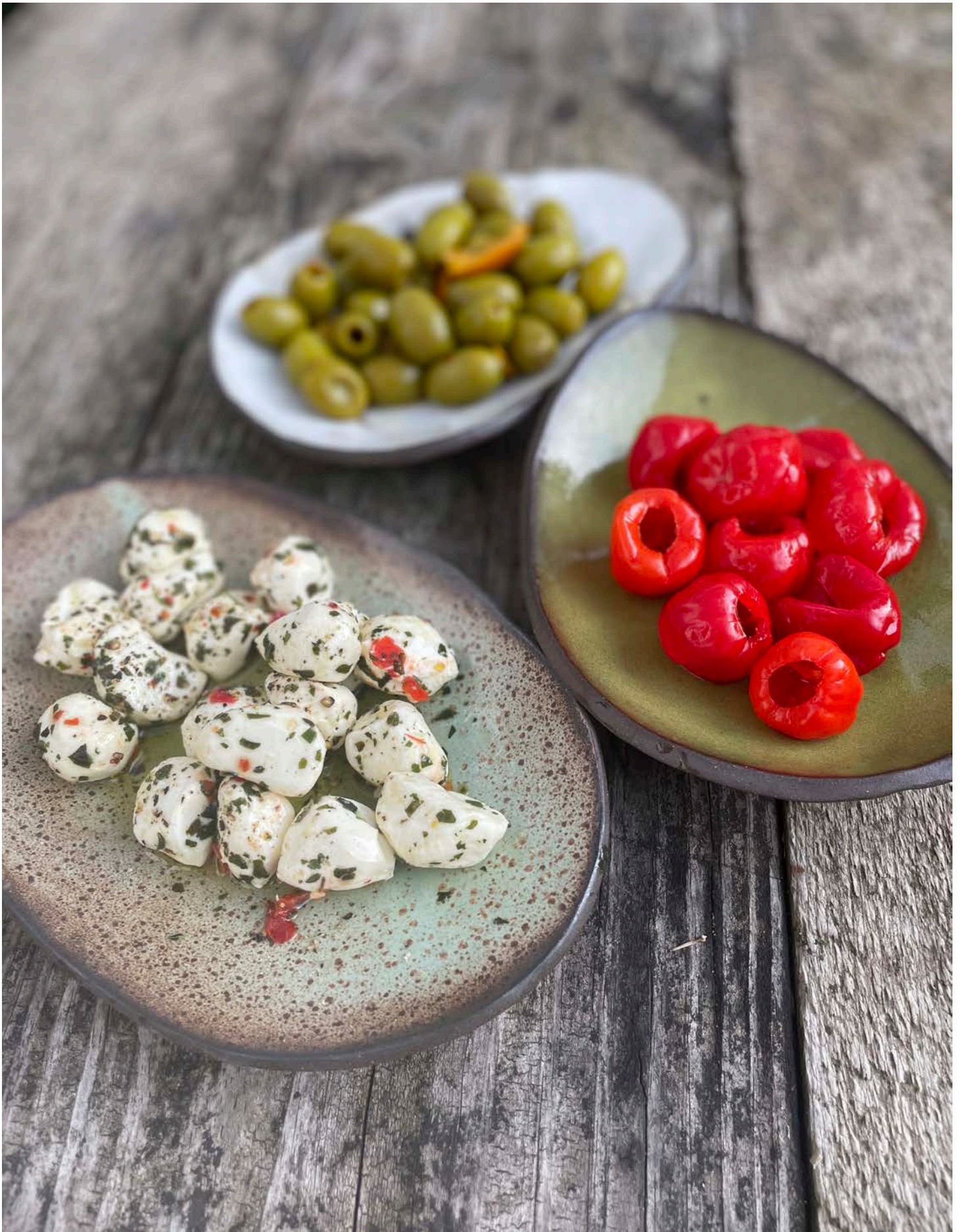
Small Stackables in Pistachio, Avacado and Linen