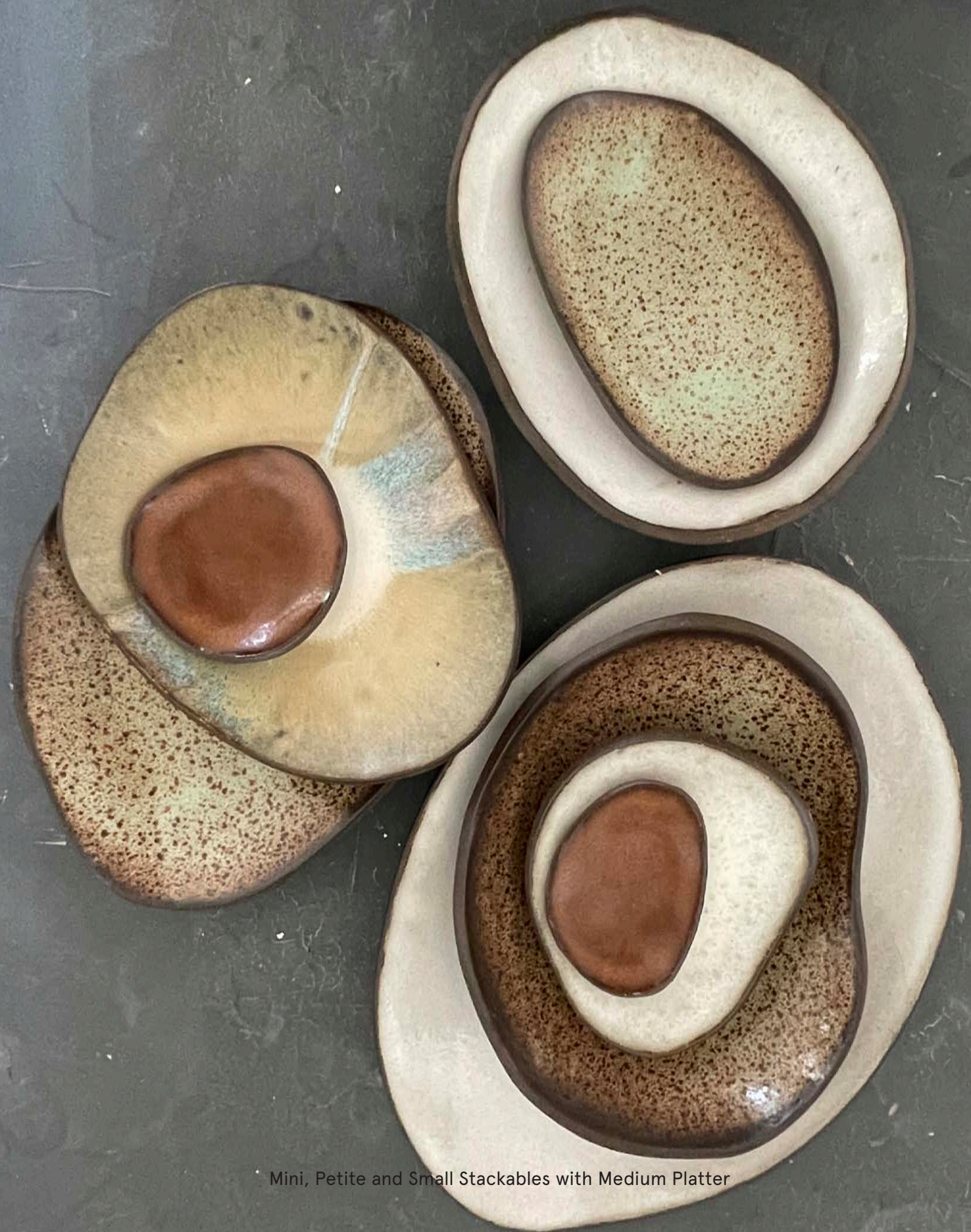
Mini, Petite and Small Stackables with Medium Platter